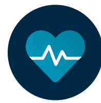
Health and Wellbeing